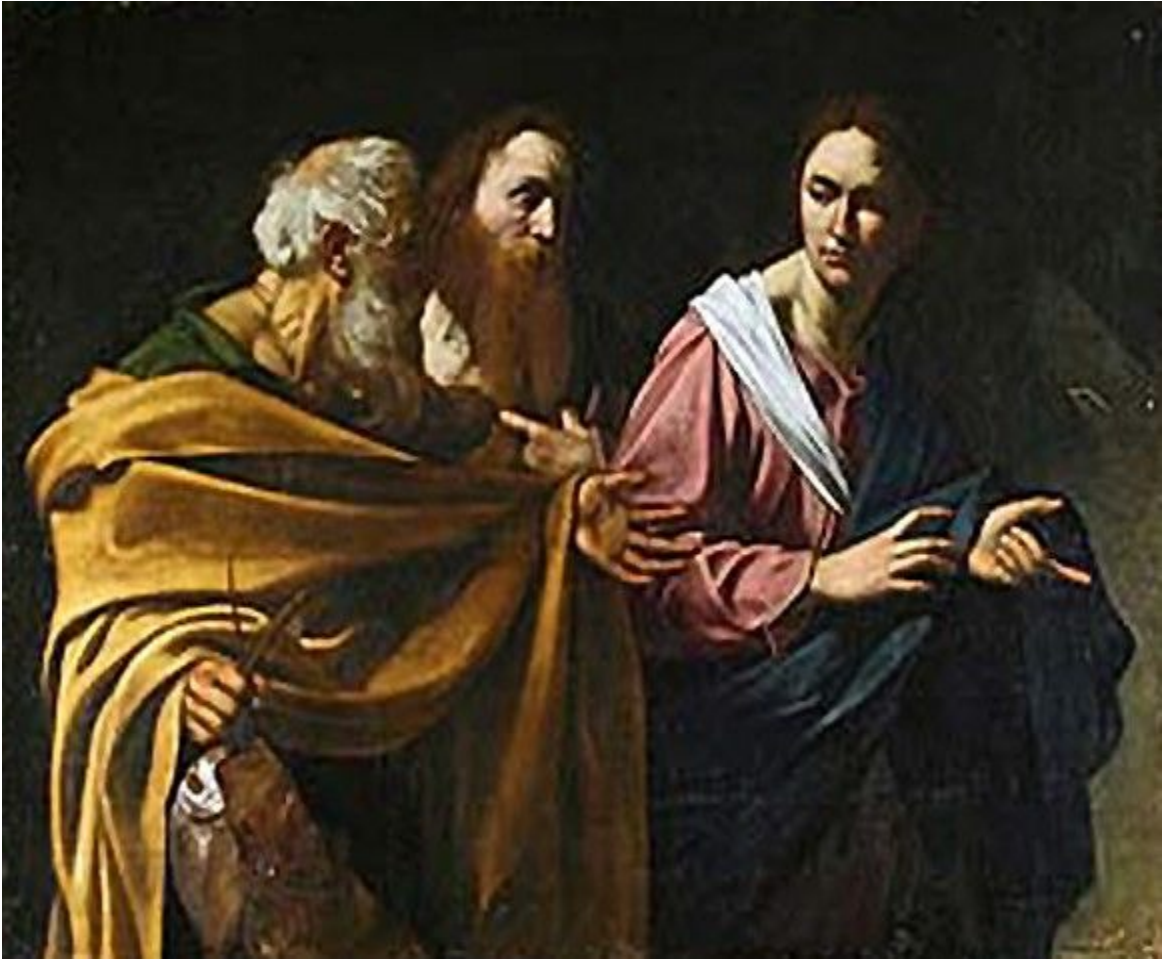
The calling of Saints Peter and Andrew by Caravaggio